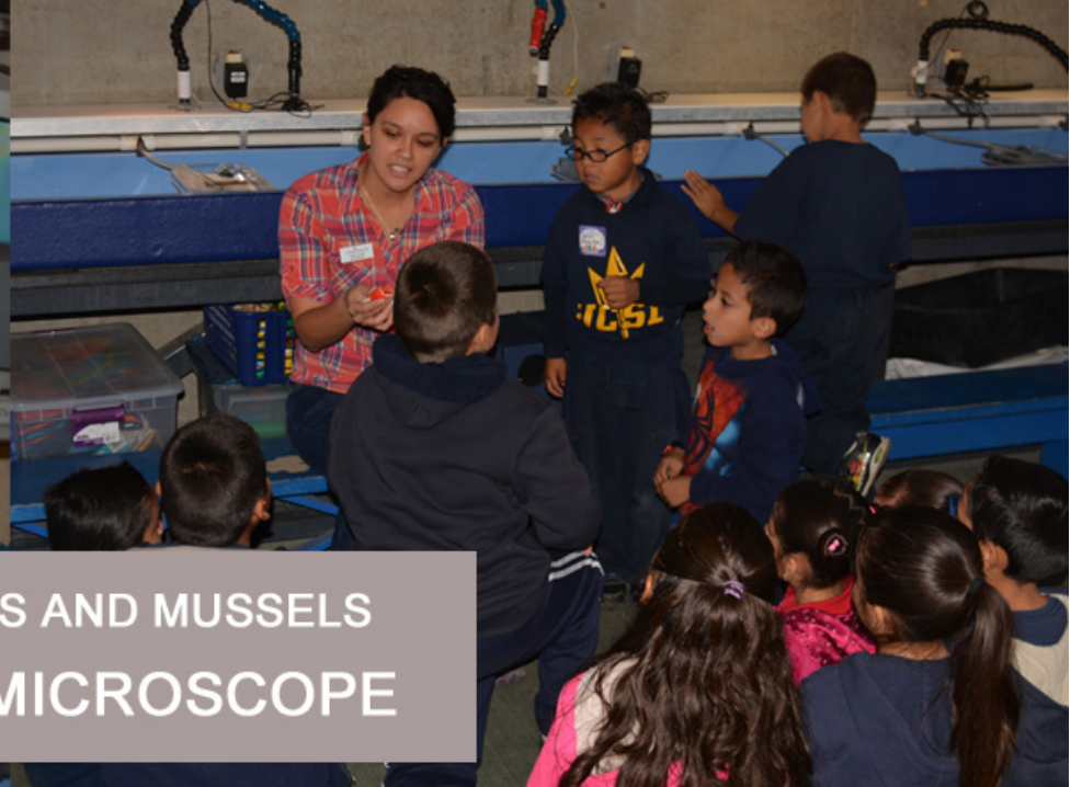
STUDYING CRABS AND MUSSELS UNDER VIDEO MICROSCOPE