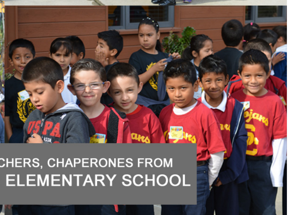
MEETING STUDENTS, TEACHERS, CHAPERONES FROM MARTIN LUTHER KING ELEMENTARY SCHOOL