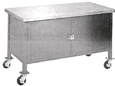
Mobile Workbench with Security Cabinet, Maple Butcher Block Safety Edge, 60"W x 30"D, Blue