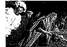
Re-enacting the pilgrimage of Mary and Joseph

Las Posadas is a Hispanic Christmastime tradition that includes the re-enactment of Joseph and Mary seeking lodging on the eve of Jesus' birth. After the re-enactment, pan dulce, chocolate, and piñatas are enjoyed by all ages. In the past, this program has been held at the Kemp Center for the Arts, Our Lady of Guadalupe Church and Midwestern State University's Clark Student Center.