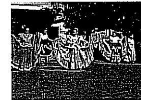
Folklorico, Grupo Mexitizo 2010

Calle Ocho is a music, arts, and culture festival held in the heart of historic downtown Wichita Falls. This celebration wraps up Hispanic Heritage Month that runs from September 15th to October 15th. The festival is our way of sharing the richness of our culture with everyone in the community. Calle Ocho serves as a fundraiser for scholarships and other educational programming sponsored by Zavala throughout the year.