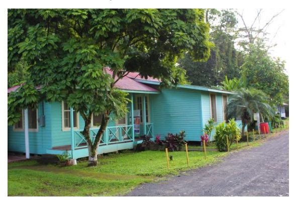
Refurbish The Sustainability House