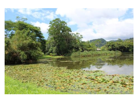
The Beautiful CATIE Campus