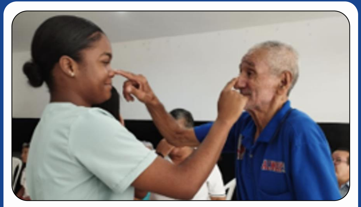
Stronger Family & Community Ties

Fénix improves daily living for seniors by addressing their physical, emotional, and cognitive needs holistically.