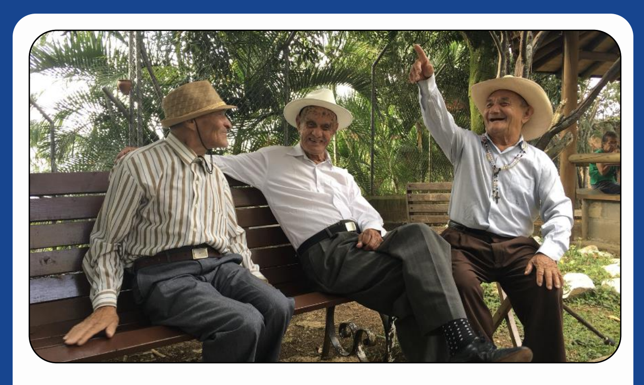
Improved Quality of Life

Fénix improves daily living for seniors by addressing their physical, emotional, and cognitive needs holistically.