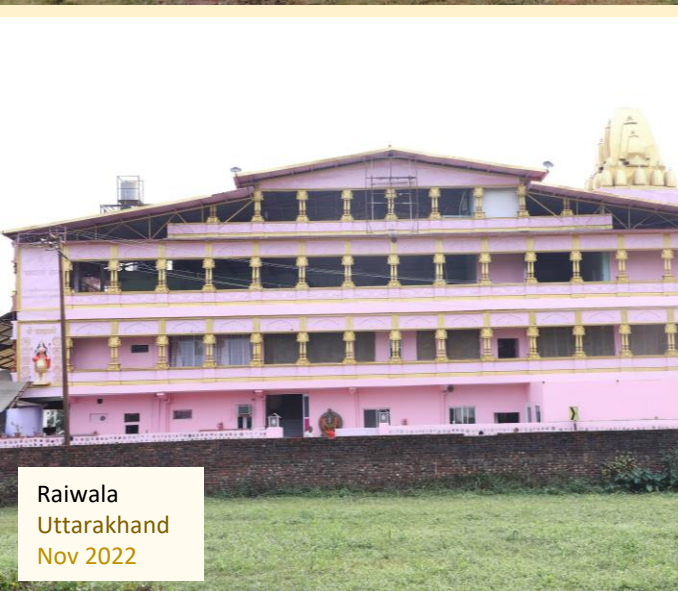
Raiwala Uttarakhand Nov 2022