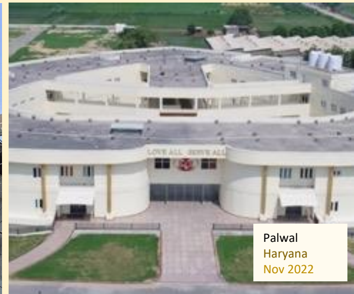
Palwal Haryana Nov 2022