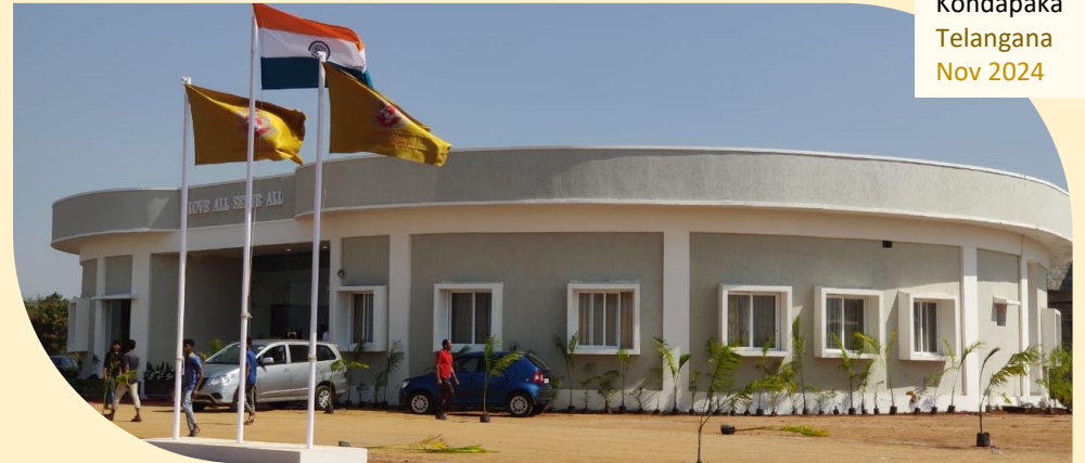
Kondapaka Telangana Nov 2024