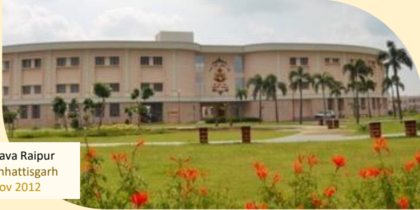
Nava Raipur Chhattisgarh Nov 2012