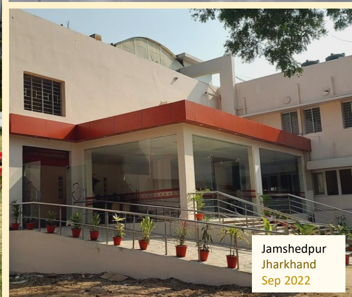
Jamshedpur Jharkhand Sep 2022