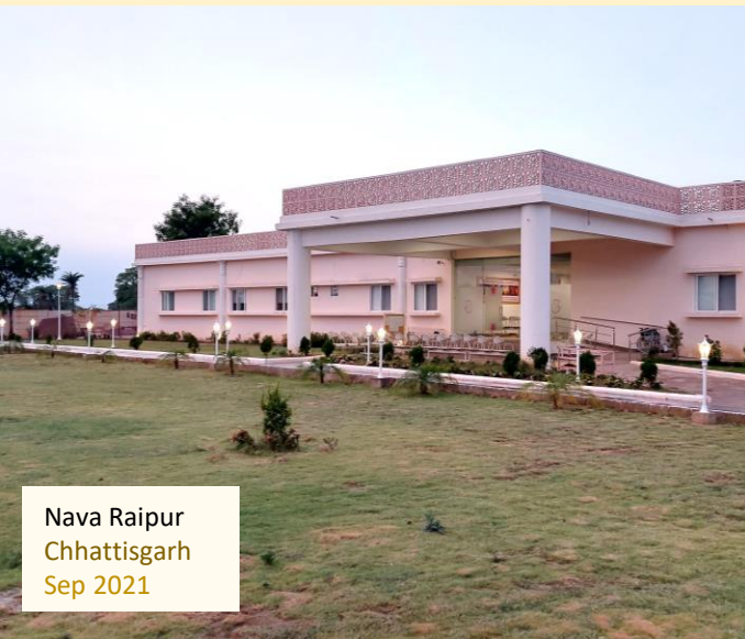
Nava Raipur Chhattisgarh Sep 2021