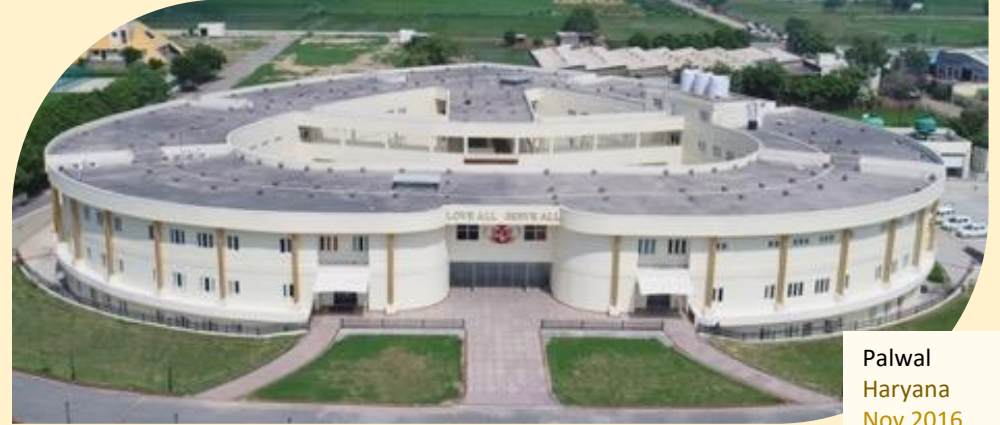
Palwal Haryana Nov 2016