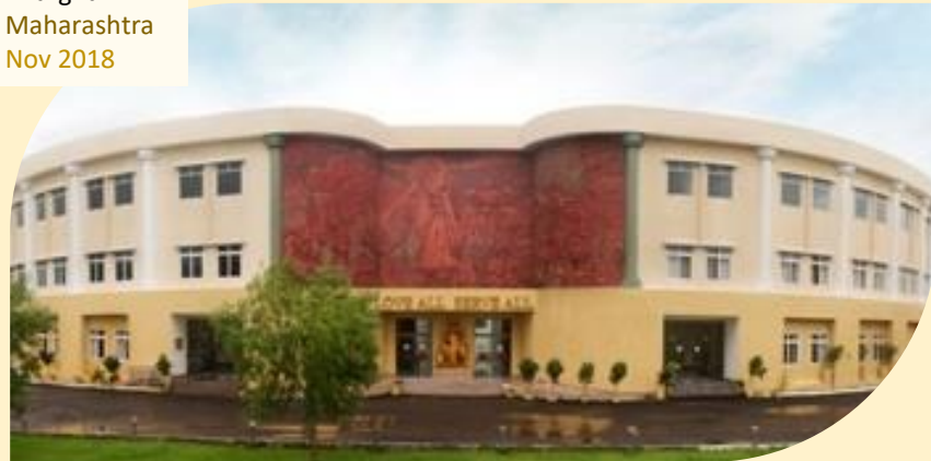
Kharghar Maharashtra Nov 2018