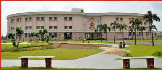
Child Heart Centre - Raipur, Chhattisgarh November 2012

Twelve years of monumental service to humanity. They stand tall bearing testimony to the healing touch love brings