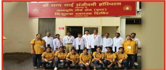
Sugreev Kila, Ayodhya, Uttar Pradesh

All Services Rendered Totally Free of Cost