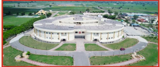
Child Heart Centre - Palwal, Haryana November 2016