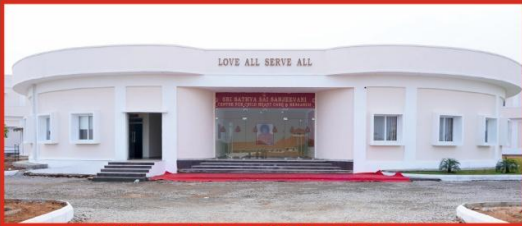
Child Heart Centre - Siddipet, Telangana November 2022