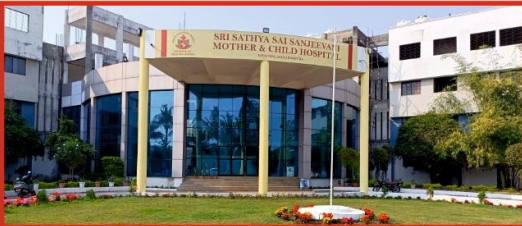
Mother & Child Centre - Yawatmal, Maharashtra January 2022