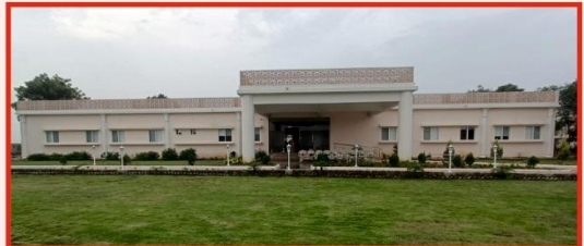
Mother & Child Centre - Raipur, Chhattisgarh September 2021