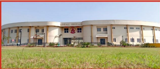
Mother & Child Centre - Palwal, Haryana January 2022