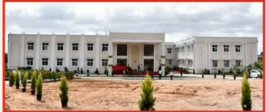
Child Heart Centre - Chikkaballapur, Karnataka November 2022