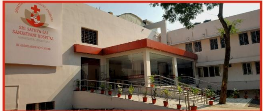
Mother & Child Centre - Jamshedpur, Jharkhand January 2022