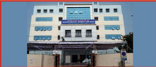
Sri Sathya Sai Sanjeevani Niloufer Hospital, Hyderabad, Telangana