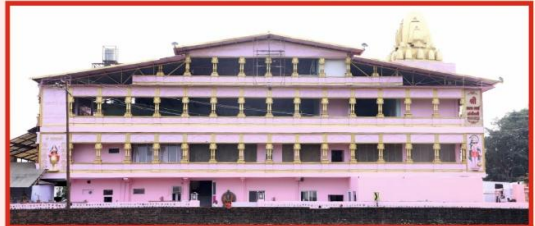
Mother & Child Centre - Raiwala, Uttarakhand November 2022